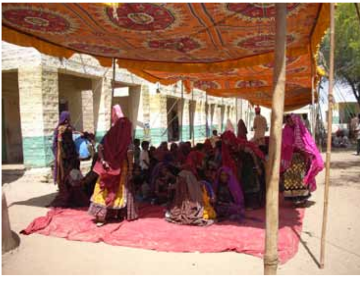
Jinjiyali outreach camp, Jaisalmer district, Rajasthan