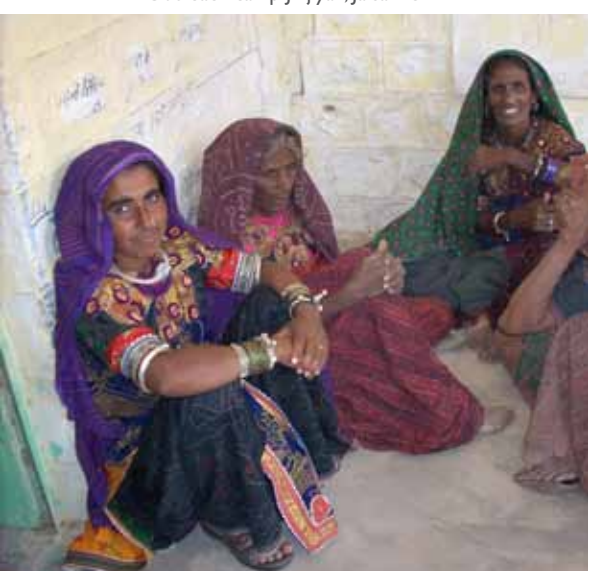
Tribal Women in Karnataka