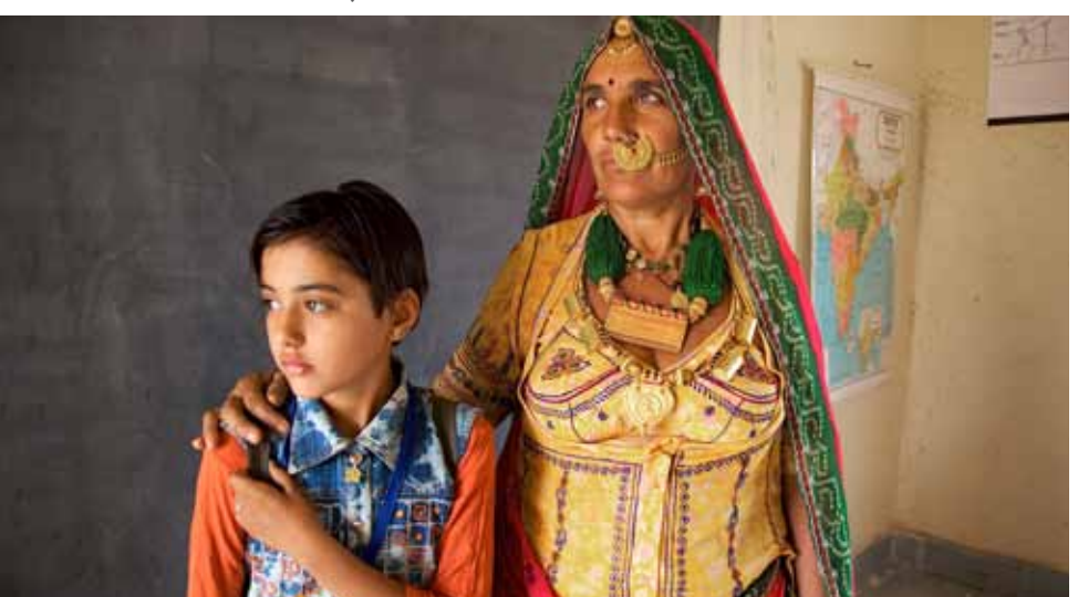
Community meeting at Manpura Village, Chittorgarh district, Rajasthan