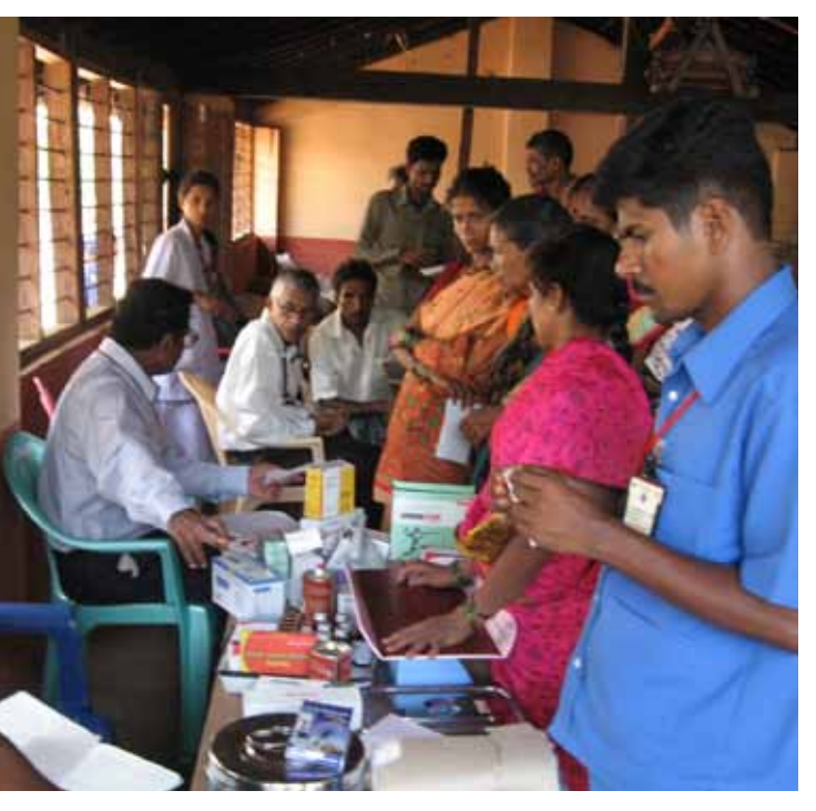
Mobile Health Clinic in action in Karnataka

aken together, these activities in Rajasthan, Karnataka and Tamil Nadu have significantly contributed to better access to health care by poor, underserved tribal populations. Almost all the services have been provided through public private partnerships. Performance data clearly reveal a robust and rising uptake of services. Patient Satisfaction Surveys conducted by independent agencies indicate that counselors, citizens help desks, mortuary vans, etc. were particularly valued by these populations.