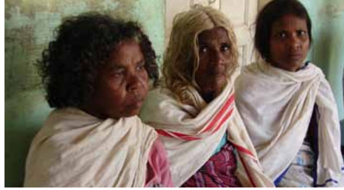
Tribal women in Tamil Nadu