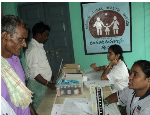
Vizag: Bheemli (Service Point near Revidi PHC)

The principle of “doctor –initiated- drugs” which are then continued by the paramedics in the van is an interesting innovation. One problem with it is when some patients suffering from non-